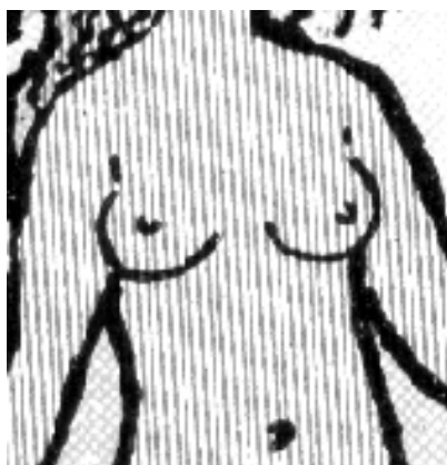
Linear screen (Pamela-A)

The technique used for printing the first editions of the Waite-Smith tarot was color-lithography. In the last decades of the 19th century, color printing developed in several ways, combining earlier color printing methods and experiments took place to substitute the manual work by mechanical aids, thus making printing easier. The fundamental process used one lithographic stone to print the black hand drawn line art and lettering, which could either be drawn directly on the stone by the artist (or by a transcriber), or a special prepared paper could be used for the