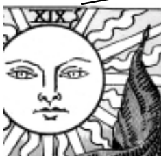
Sun with undulating line Pamela A,C,D,E