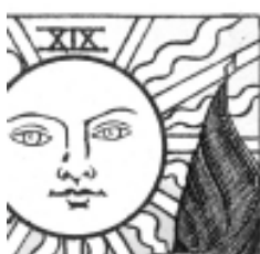
Sun without undulating line (Pamela-B only)

We do not know to what extent Pamela Colman Smith was involved in the printing process of the tarot deck. In November 1909 in a letter to Alfred Steglitz she, however, mentioned that she had made the illustrations for the tarot deck „a big job for little money“, adding „I'll send you a pack .. printed in colour by lithography... probably very badly!....“. At the same time she offered Steglitz some of the originals for sale. This indicates that she (and not Waite) was in possession of the originals and also that she had not much belief that the printing process would reproduce her works in an acceptable way. She could have made the material for the printing, by either drawing directly on the stones, or by using the transfer method. If she didn't, another person had to redraw her illustrations, and add the coloring tints (by hand or by the mechanical process). The use of a transcriber would explain the many differences in the artwork between the editions.