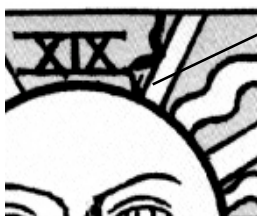
Sun with heavy undulating line and extra line Pamela-C only